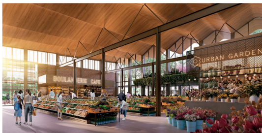
ARTIST IMPRESSION - SUBJECT TO CHANGE