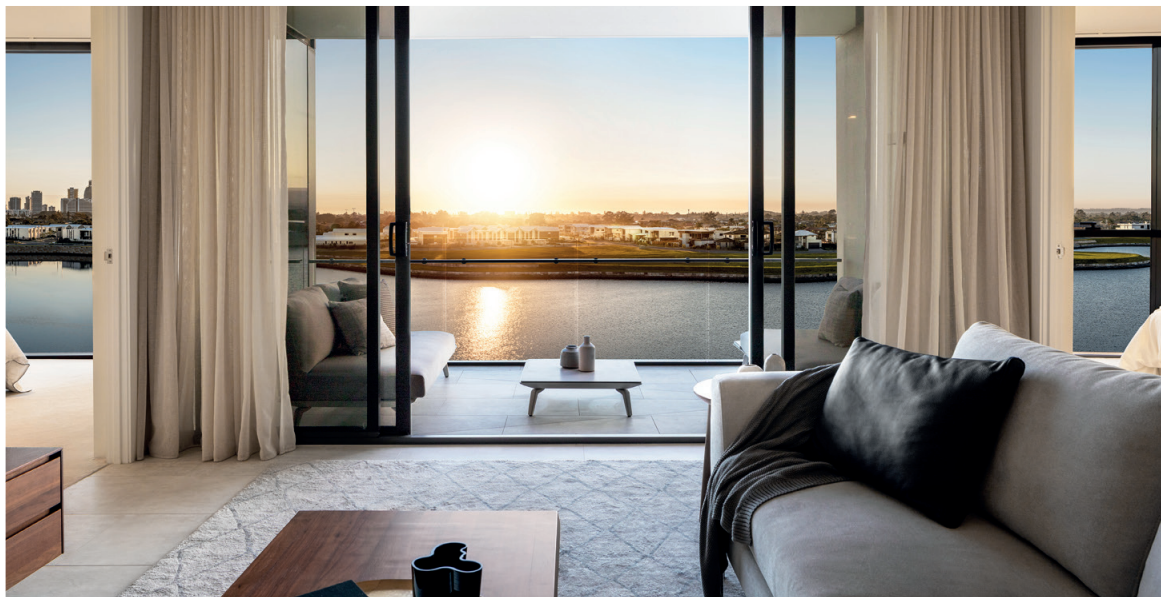
ARTIST IMPRESSION - SUBJECT TO CHANGE

Sunland Group is delighted to present The Lanes Residences – West Village - two boutique lakefront apartment buildings mirroring Stage One, where pioneering architecture, retail and amenity come together to create the ultimate lifestyle destination.