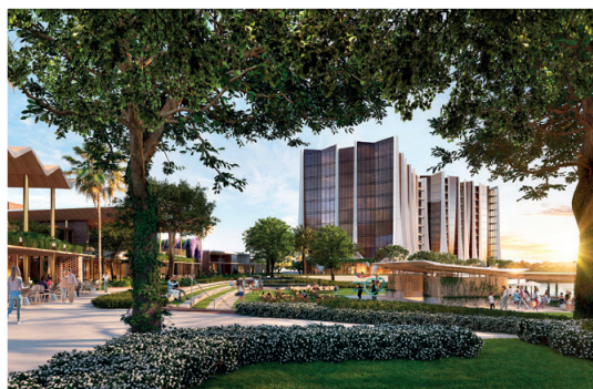
ARTIST IMPRESSION - SUBJECT TO CHANGE

The Lanes Residences is located within the visionary master plan of The Lakes in Mermaid Waters on the Gold Coast. This 42-hectare precinct will evolve sensitively and sustainably over time – residential housing, apartments and landscaped leisure spaces, intimately connected to their unique waterfront setting. From its central position, The Lanes Residences is only five minutes from the retail and dining precincts of Broadbeach, home to Pacific Fair and The Star Hotel and Casino, and 20 minutes to Gold Coast Airport. The spectacular surf beaches of Surfers Paradise and Burleigh, and seven excellent primary and secondary schools, are also close by.