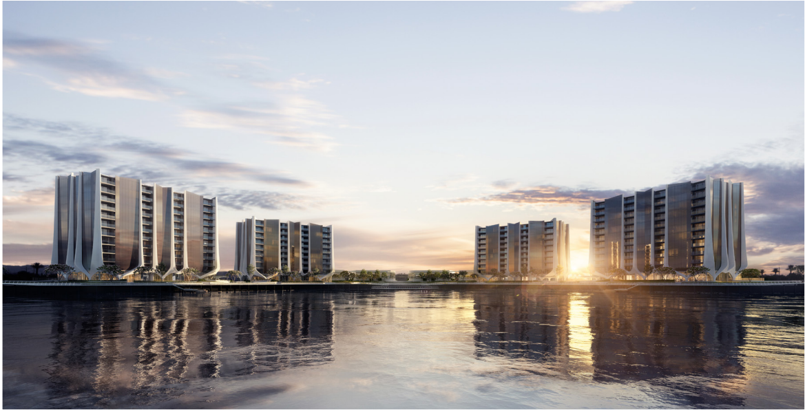
ARTIST IMPRESSION - SUBJECT TO CHANGE

Sunland Group is proud to present The Lanes Residences – four boutique lakefront apartment buildings in the heart of Mermaid Waters, where pioneering architecture, retail and lifestyle amenity come together to create the ultimate lifestyle destination.