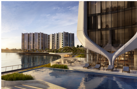
ARTIST IMPRESSION - SUBJECT TO CHANGE