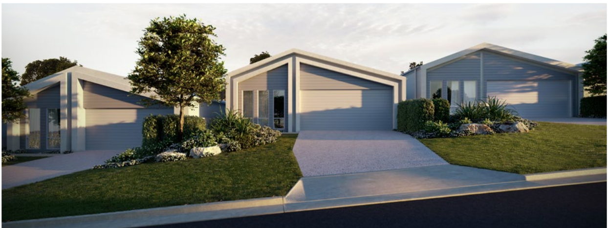
All artist impressions are indicative only.

Each home is carefully designed to complement its surroundings, maximising the natural light and breezes with large windows and glass sliding doors which seamlessly integrate the indoor and outdoor living areas.