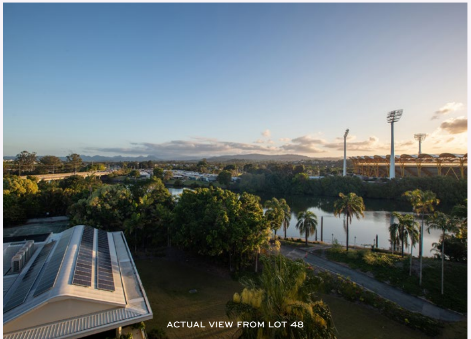
ACTUAL VIEW FROM LOT 48

INTERNAL AREA 90m 2 BALCONY AREA 4m 2 TOTAL AREA 94m 2