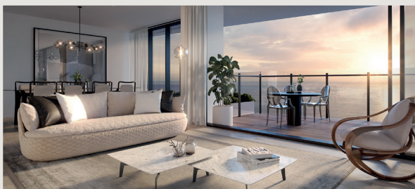
ARTIST IMPRESSION, INDICATIVE ONLY. TIMBER BALCONIES PROVIDED TO PENTHOUSE APARTMENTS ONLY, REFER TO INDIVIDUAL FLOOR PLANS FOR FINISHES.

The striking landscaped façades of the twin mid-rise apartment buildings at Magnoli Apartments creates the effect of a cascading urban garden. This intimate connection to the natural environment is further entwined through generous landscaped setbacks and the creation of a large community parkland. Private resident amenities include a resort-style pool, lounge, and landscaped gardens and entertaining areas. The six architectural homes, located within the precinct, also enjoy access to all exclusive resident amenities, including secure basement parking.