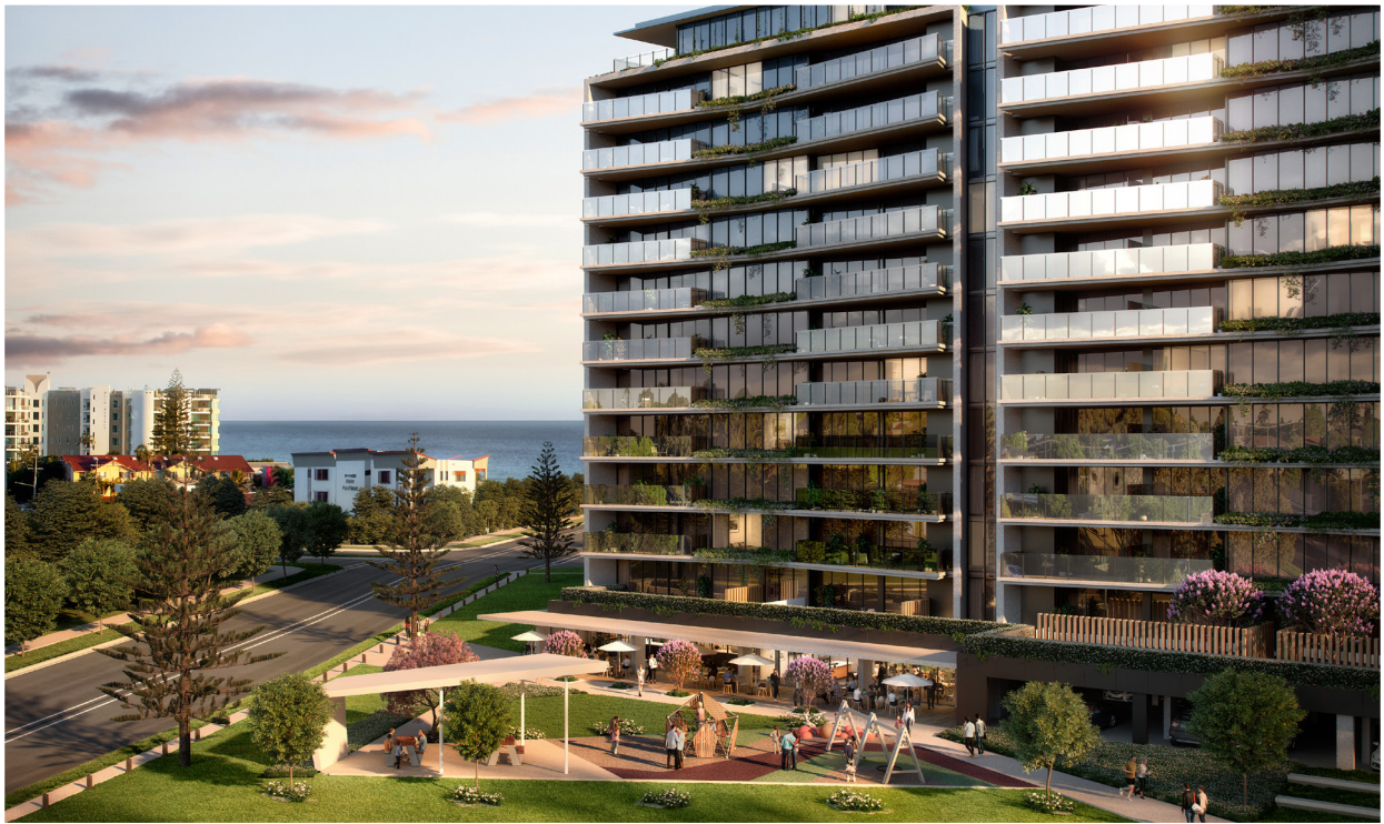
ARTIST IMPRESSION - INDICATIVE ONLY

Sunland Group is proud to present Magnoli Apartments – a collection of boutique residential apartments and architecturally designed terrace homes, only metres from the pristine coastline of Palm Beach.