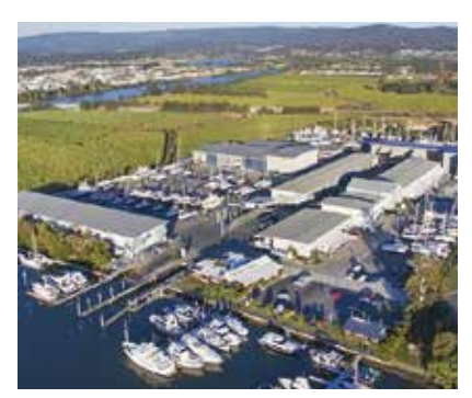
The Boat Works marina and shipyard, Coomera

DISCLAIMER - This document has been prepared by Sunland Group and is for general information only. This document does not provide investment advice. While the information contained in the document has been researched and prepared with all due care, the users of the document must obtain their own independent advice and conduct their own investigations and assessment regarding the information. The information in this document is subject to change.