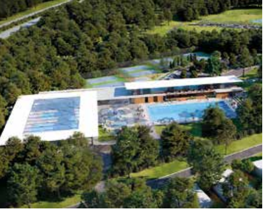
An artist's impression of the $56.5 million Northern Gold Coast Sports Precinct to start construction in 2018.