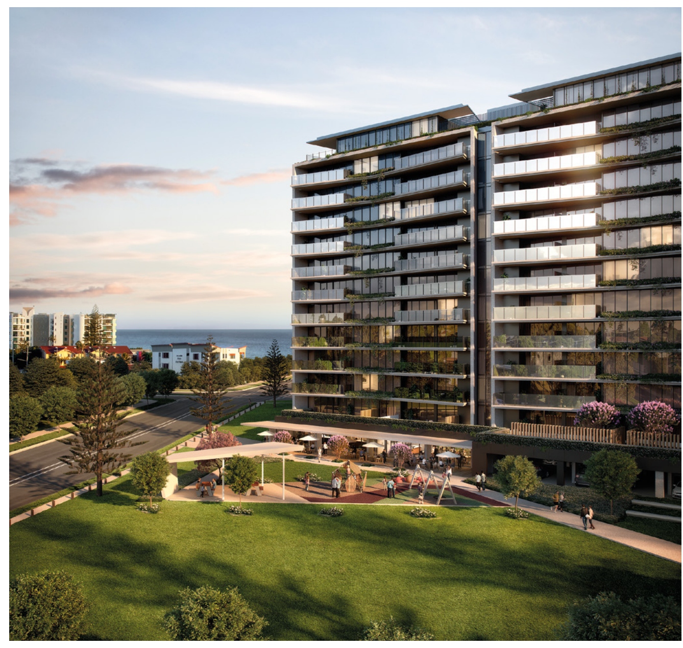
ARTIST IMPRESSION - SUBJECT TO CHANGE