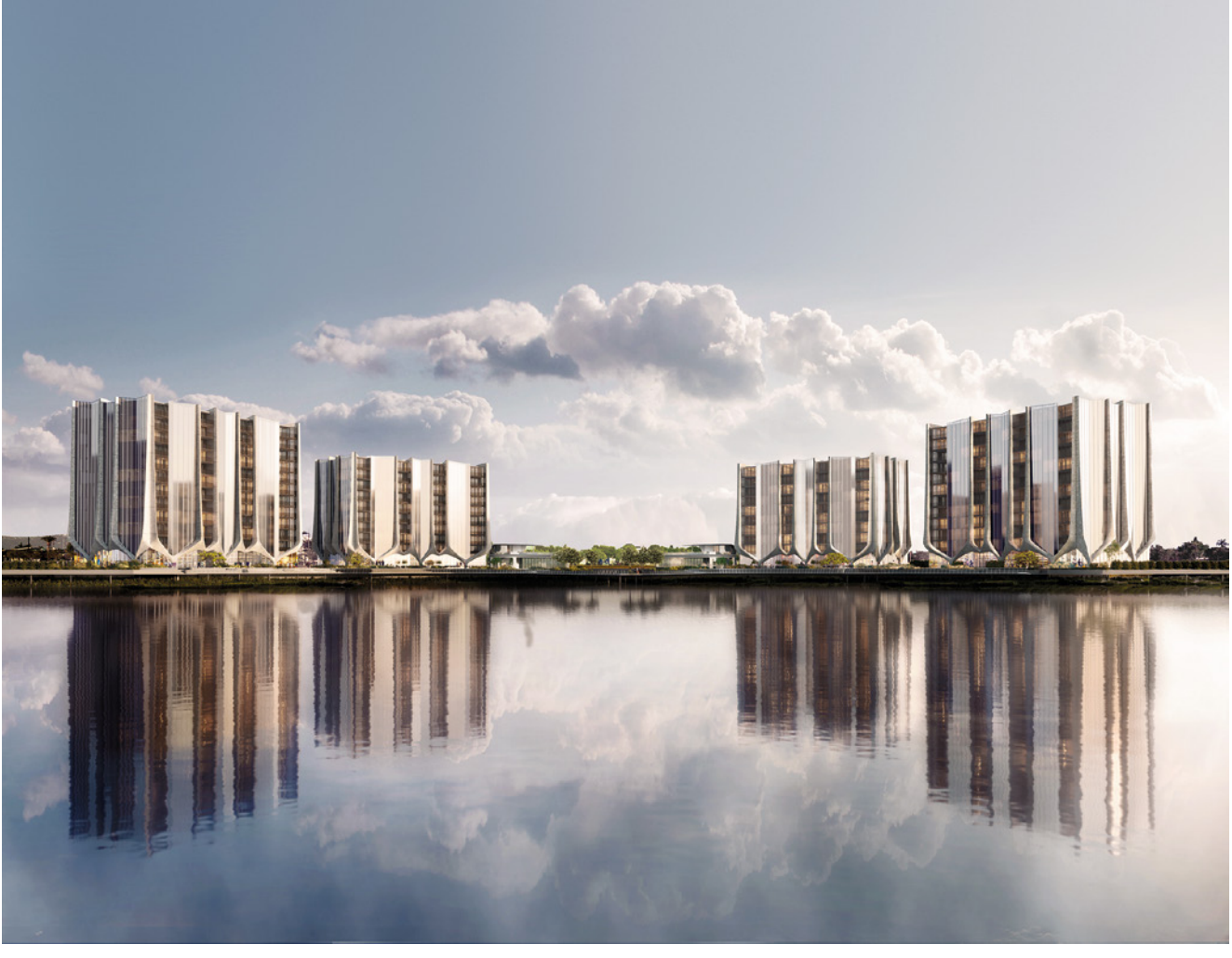
ARTIST IMPRESSION - SUBJECT TO CHANGE