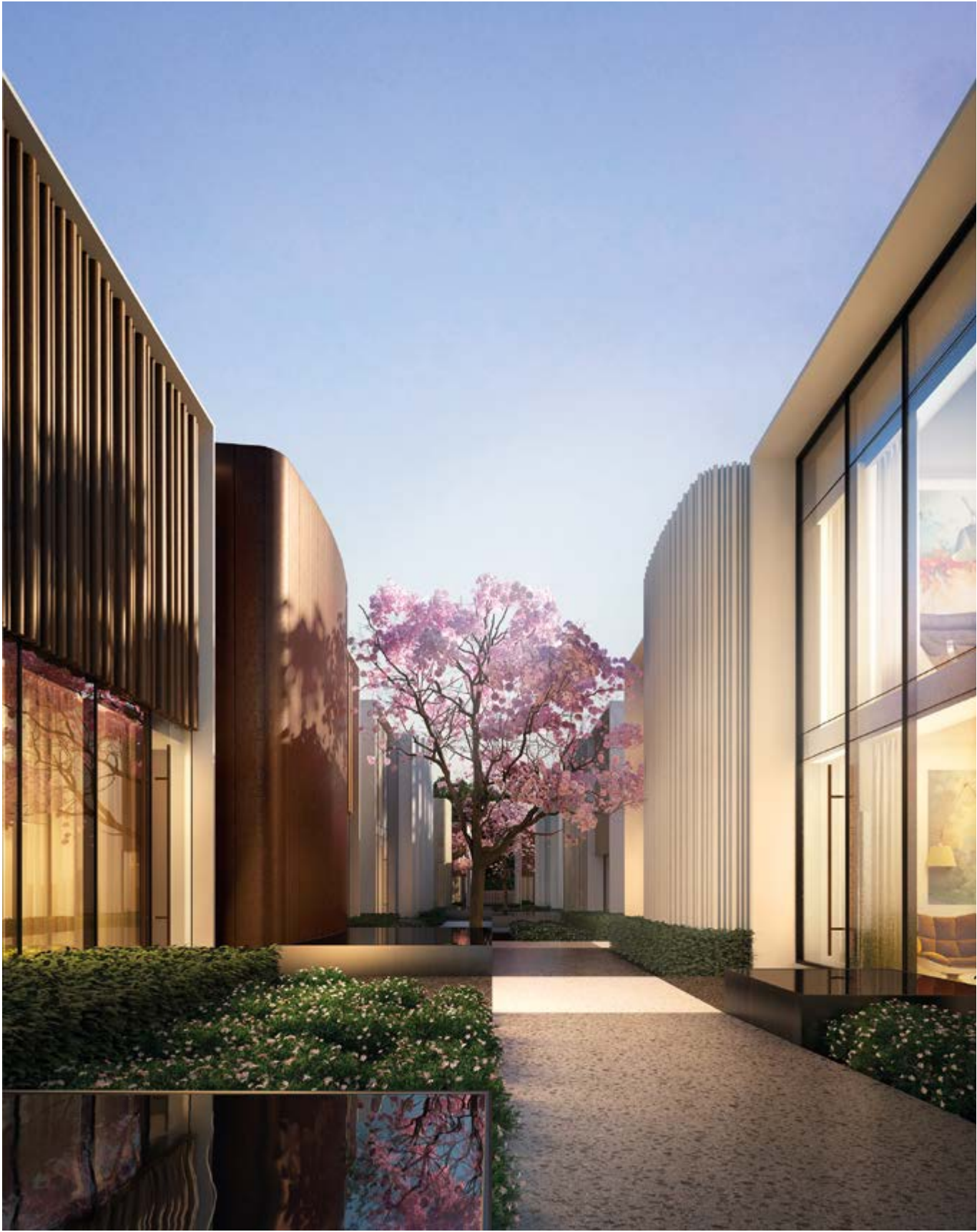
ARTISTS IMPRESSION – INDICATIVE ONLY.

The unique basement car park design features secure garages, additional storage and private lift access.