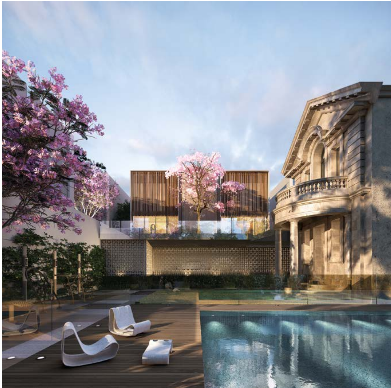
ARTISTS IMPRESSION – INDICATIVE ONLY.

The majestic sandstone garden pavilion has been preserved and transformed into a stunning resident amenities building featuring a private cinema, lounge and entertaining kitchen overlooking the resort-style pool.