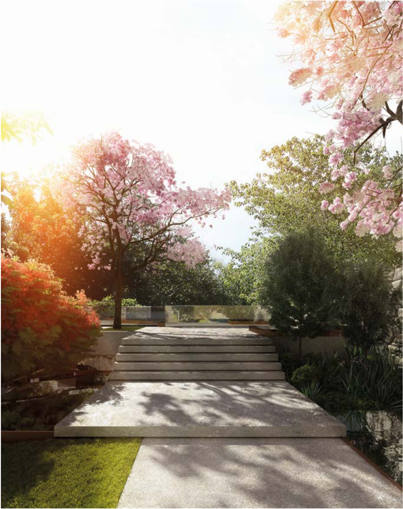
ARTISTS IMPRESSION – INDICATIVE ONLY.