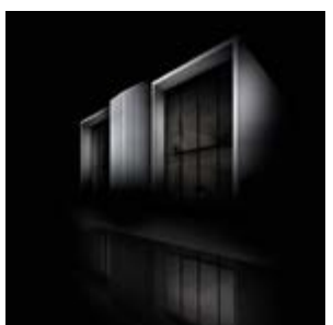
[2014] CARRÉ RESIDENCES [2014] DAHLIA RESIDENCES [2014] ABIAN