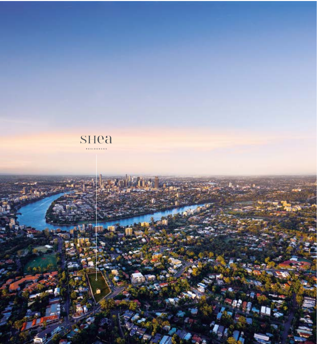
SHEA RESIDENCES IS LOCATED IN THE HEART OF ST LUCIA, 6 KILOMETRES FROM THE BRISBANE CBD.

The peninsula suburb of St Lucia is as prestigious as it is beautiful, bounded on three sides by the meandering curves of the Brisbane River.