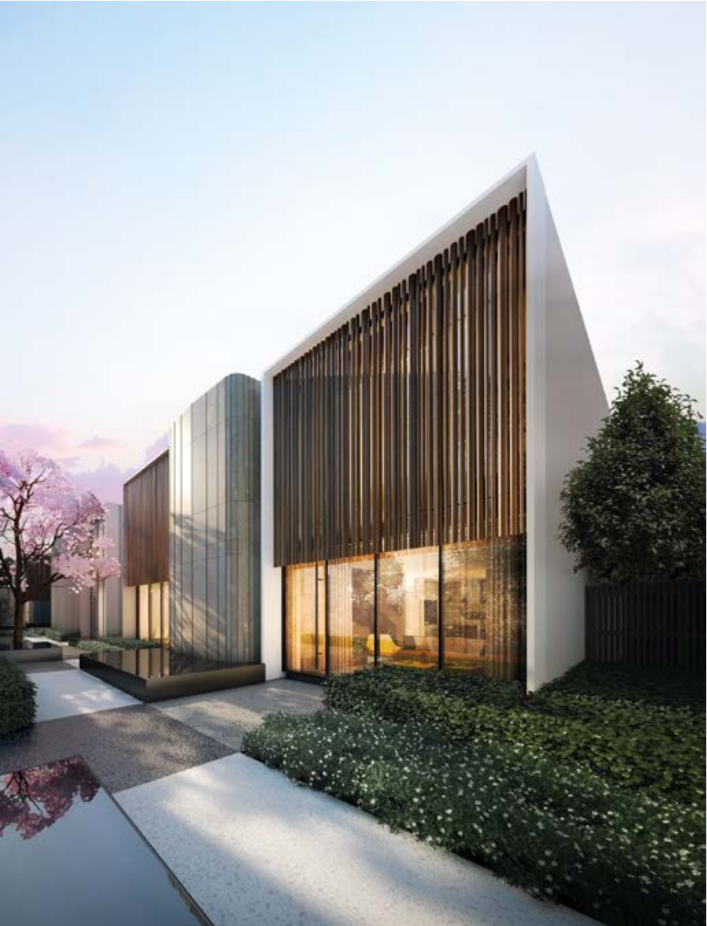
ARTISTS IMPRESSION – INDICATIVE ONLY.