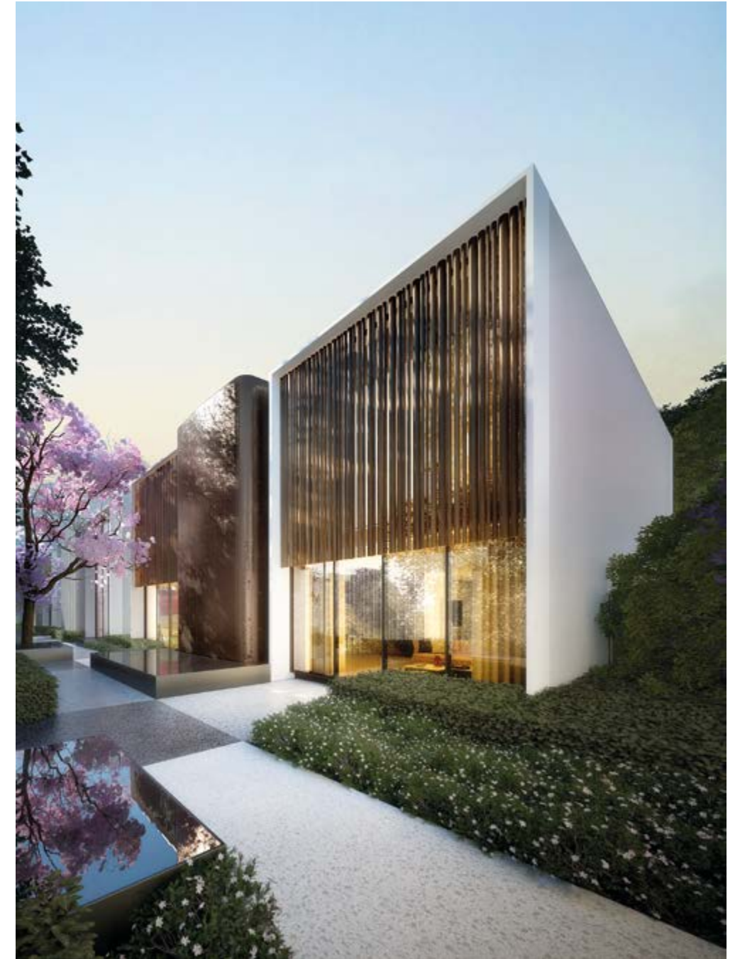
ARTISTS IMPRESSION – INDICATIVE ONLY.

PRIVATE GARDENS AND REFLECTION POOLS SOFTLY INTERLACE THE PAIRED RESIDENCES ALONG THE SCULPTURAL CENTRAL SPINE, ENHANCING THEIR BEAUTY AND PRIVACY.