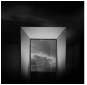
[2014] CONCOURSE VILLAS [2014] THE GARDENS [2014] THE GARDENS DISPLAY