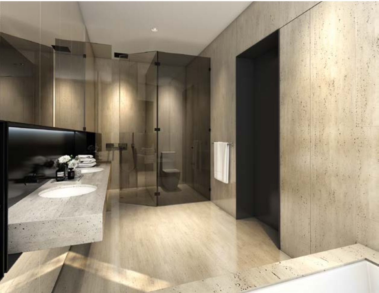
ARTISTS IMPRESSION – INDICATIVE ONLY.

BATHROOM DESIGN IS BEAUTIFUL AS WELL AS FUNCTIONAL, WITH STYLISH STONE BENCH TOPS CANTILEVERED FROM AN ELEGANT WALL RECESS.