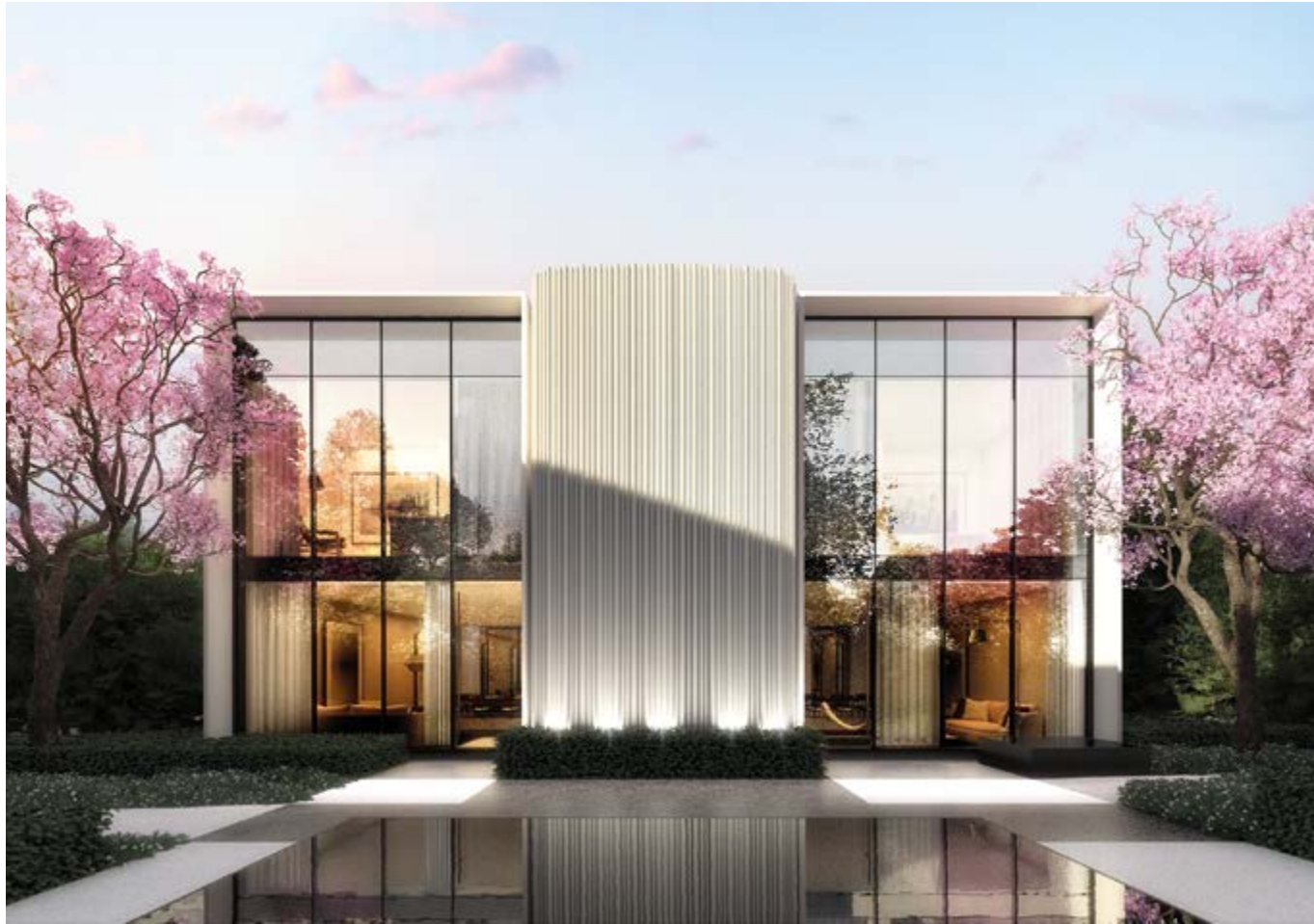
ARTISTS IMPRESSION – INDICATIVE ONLY.

PRIVATE GARDENS AND REFLECTION POOLS SOFTLY INTERLACE THE PAIRED RESIDENCES ALONG THE SCULPTURAL CENTRAL SPINE, ENHANCING THEIR BEAUTY AND PRIVACY.