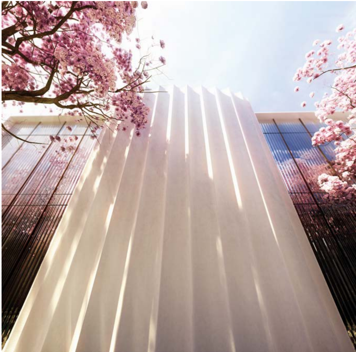
ARTISTS IMPRESSION - INDICATIVE ONLY.

From its rare vantage point, Shea Residences presents a vibrant interpretation of the timeless elegance and affluence for which St Lucia is renowned.