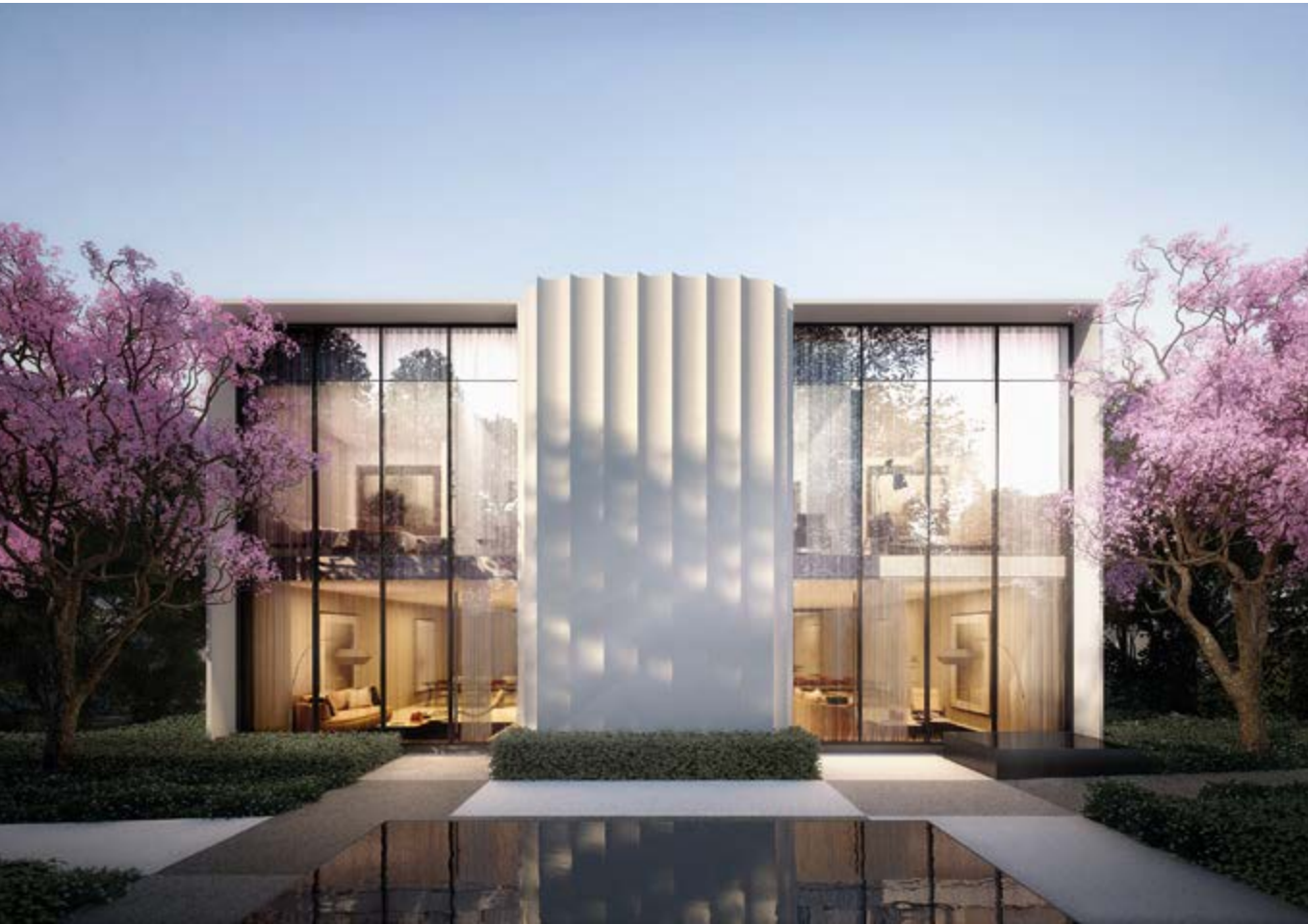
ARTISTS IMPRESSION – INDICATIVE ONLY.

Exquisite architectural façades of travertine and copper are counterpoised by the elegant luminance of flute and curtain inspired entrances.