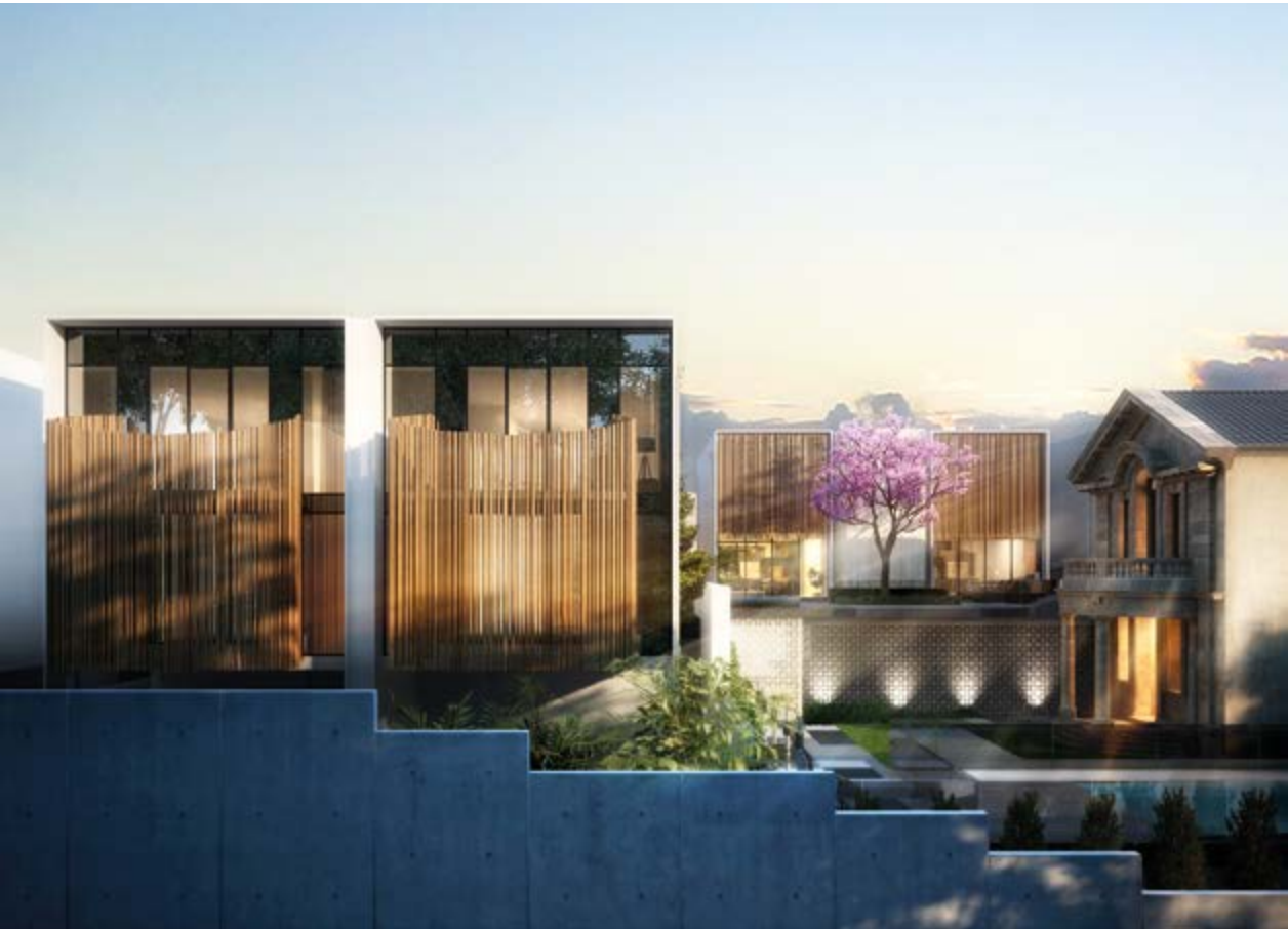
ARTISTS IMPRESSION – INDICATIVE ONLY.