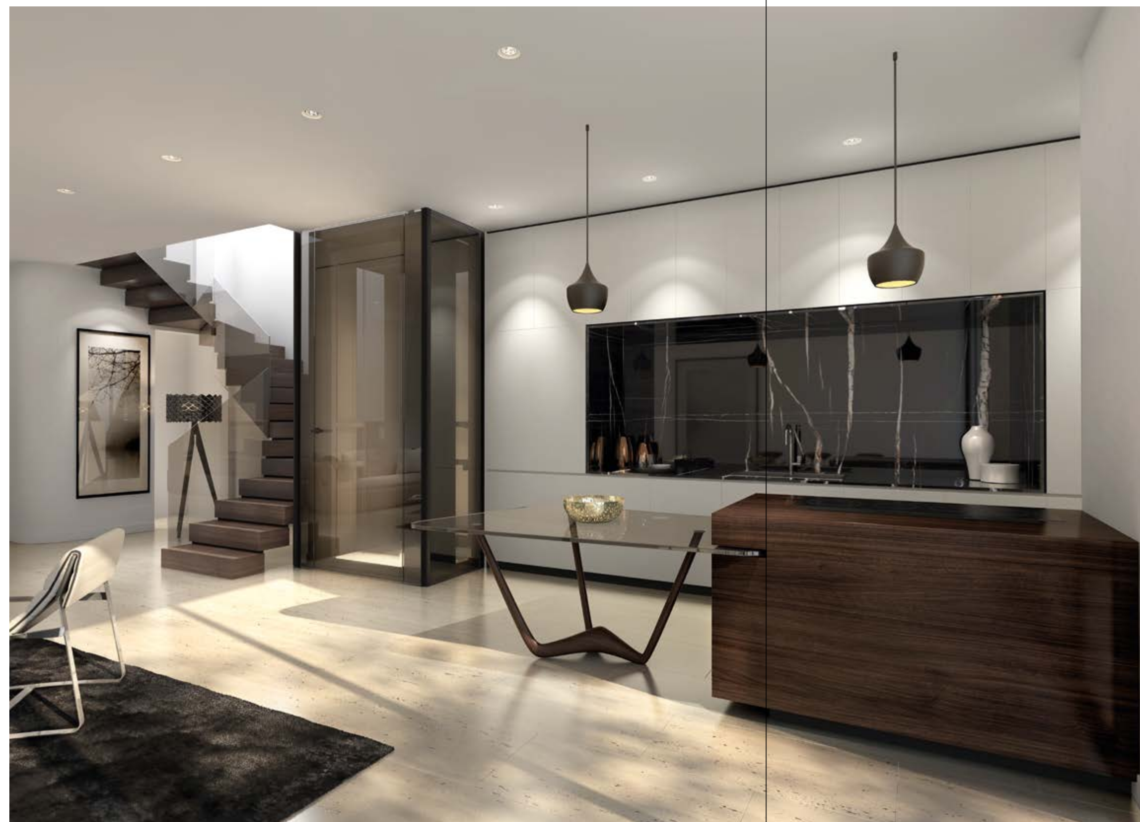
ARTISTS IMPRESSION – INDICATIVE ONLY.

At Shea Residences, contemporary open plan interiors offer every advantage of space and natural light, while refined finishes and sumptuous textures create a functional sophistication.