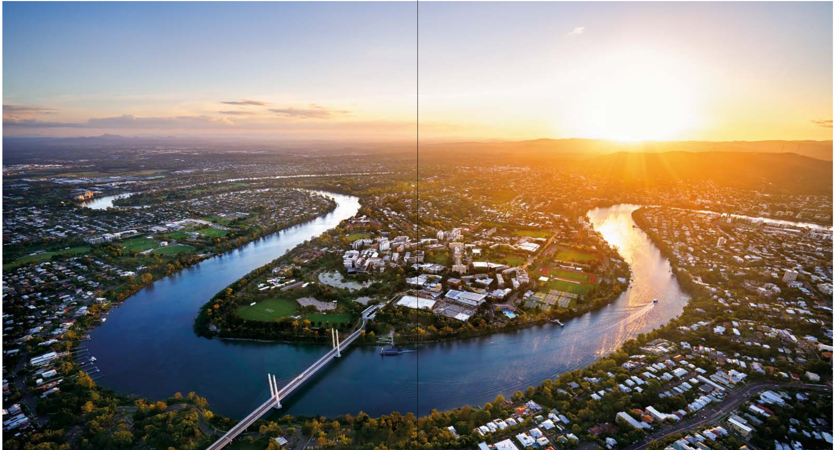
THE UNIVERSITY OF QUEENSLAND ST LUCIA CAMPUS SPANS 114 HECTARES OF THE RIVERSIDE SUBURB.