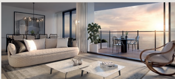
ARTIST IMPRESSION, INDICATIVE ONLY. TIMBER BALCONIES PROVIDED TO PENTHOUSE APARTMENTS ONLY, REFER TO INDIVIDUAL FLOOR PLANS FOR FINISHES.

The striking landscaped façades of the twin mid-rise apartment buildings at Magnoli Apartments creates the effect of a cascading urban garden. This intimate connection to the natural environment is further entwined through generous landscaped setbacks and the creation of a large community parkland. Private resident amenities include a resort-style pool, lounge, and landscaped gardens and entertaining areas. The six architectural homes, located within the precinct, also enjoy access to all exclusive resident amenities, including secure basement parking.