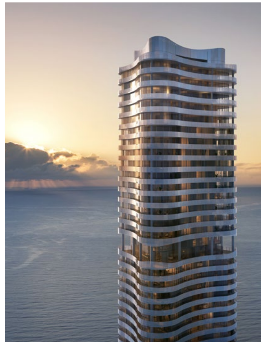
ARTIST IMPRESSION - SUBJECT TO CHANGE

272 Hedges Avenue will feature unparalleled resident amenities including a dedicated concierge service, swimming pool, spa, gym, sauna, steam room, and treatment room.