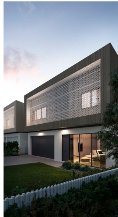
ARTIST IMPRESSION - INDICATIVE ONLY