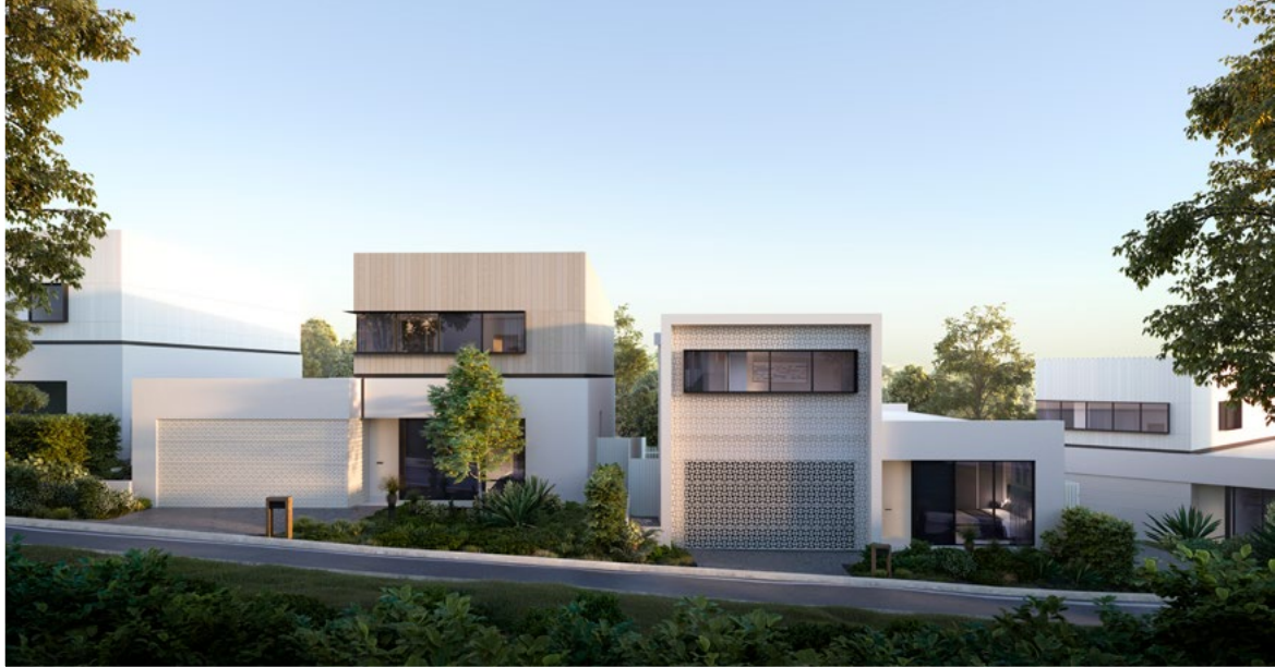
ARTIST IMPRESSION - INDICATIVE ONLY

INTRODUCING KIRKDALE RESIDENCES, A COLLECTION OF 33 ELEGANT FAMILY HOMES LOCATED IN THE HEART OF CHAPEL HILL IN BRISBANE'S INNER-WEST.